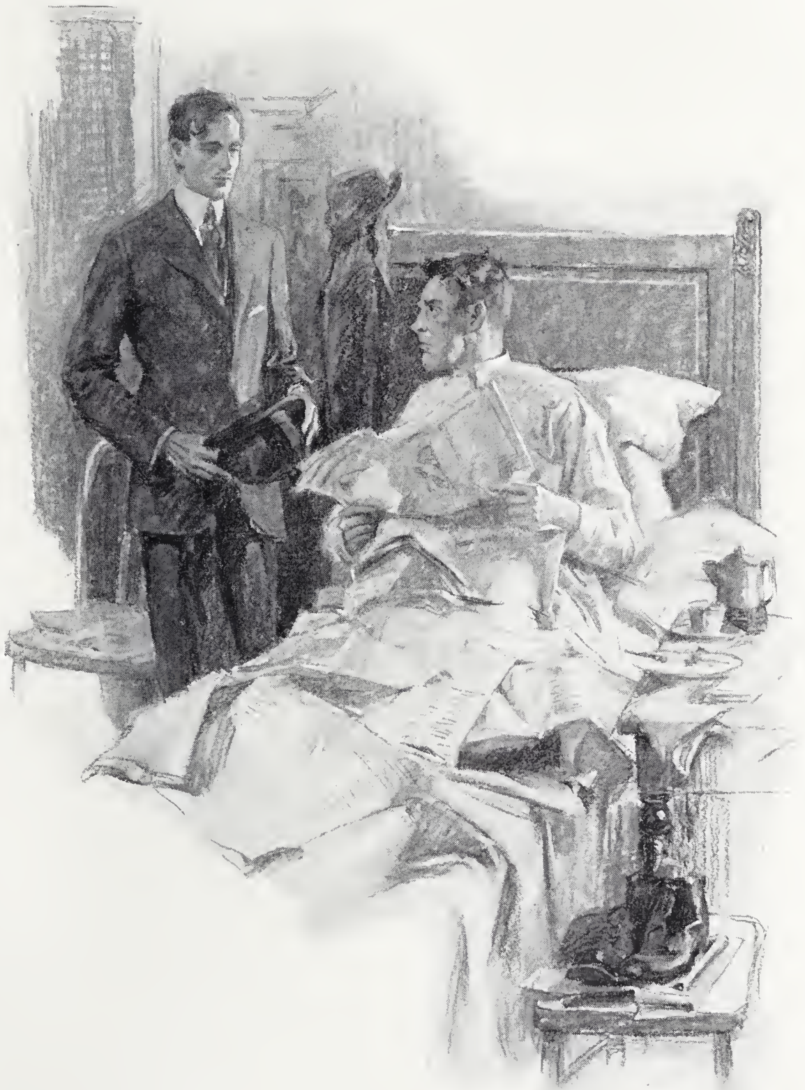
HE WAS IN BED, READING NEWSPAPERS, AS USUAL. AN EMPTY COFFEE-CUP AND A PLATE WERE ON THE LITTERED TABLE.